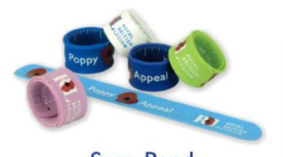
Snap Band SUGGESTED DONATION: £1.50