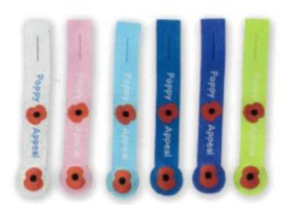
Zip Pull SUGGESTED DONATION: 50p