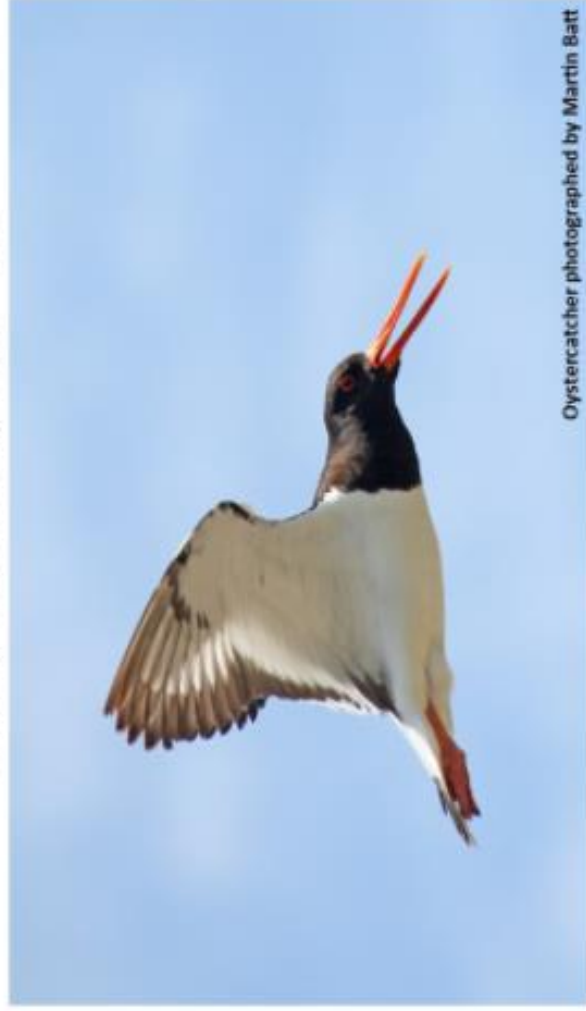
Oystercatcher

Join the rangers for a family friendly guided walk exploring the habitats of Northam Burrows and looking for signs of the wildlife that call this beautiful place home.