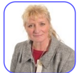
Executive Head of School