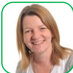
Deputy Head of School