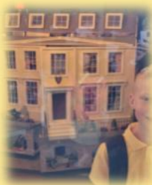
This dolls house was built by Kobi's grandmother