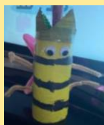
Amber's 'Bee makes tea.'