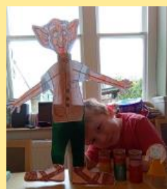
Isaac's BGF theme