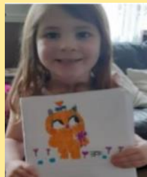
Heidi's book cover for 'Little Monster.'