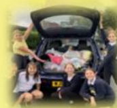
Harvest donations ready for delivery

The children have celebrated Restart a Heart Day, with all monies raised going towards the maintenance of our community defibrillator. During a visit by the South West Ambulance Service, the children were introduced to basic first aid skills and what to do in an emergency. On Wednesday, we had our annual harvest assembly. We have a huge collection of food to deliver to the Freedom Centre today. Thank you to everyone who contributed to this worthy cause.